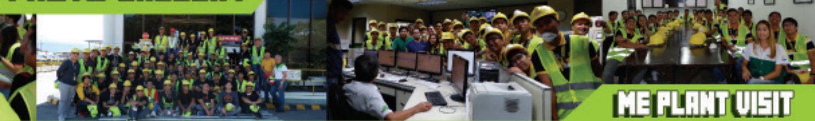
ME PLANT VISIT