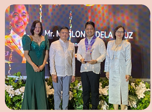
OHRDM director commended with 'mark of recognition' from CSC regional office