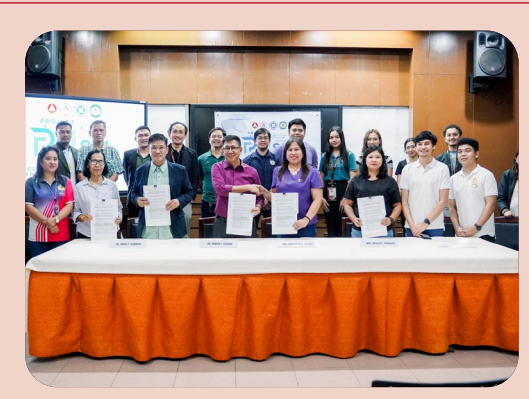
TSU, LGU Anao to work for modernized info system